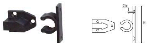
94PAF59 Fermo a pinza nylon